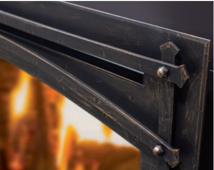
Midnight Bronze Forgeworks Surround

* Turn down is based on a 50% valve and AFUE efficiencies output.