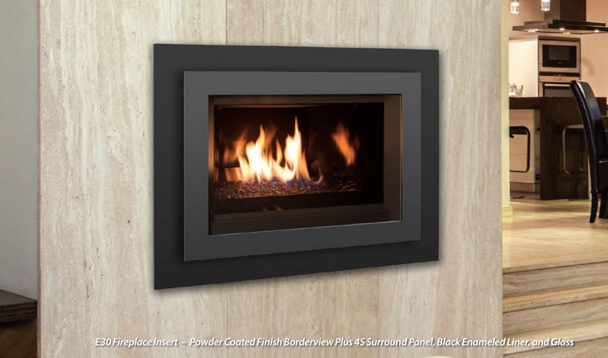
E30 Fireplace Insert – Powder Coated Finish Borderview Plus 4S Surround Panel, Black Enameled Liner, and Glass