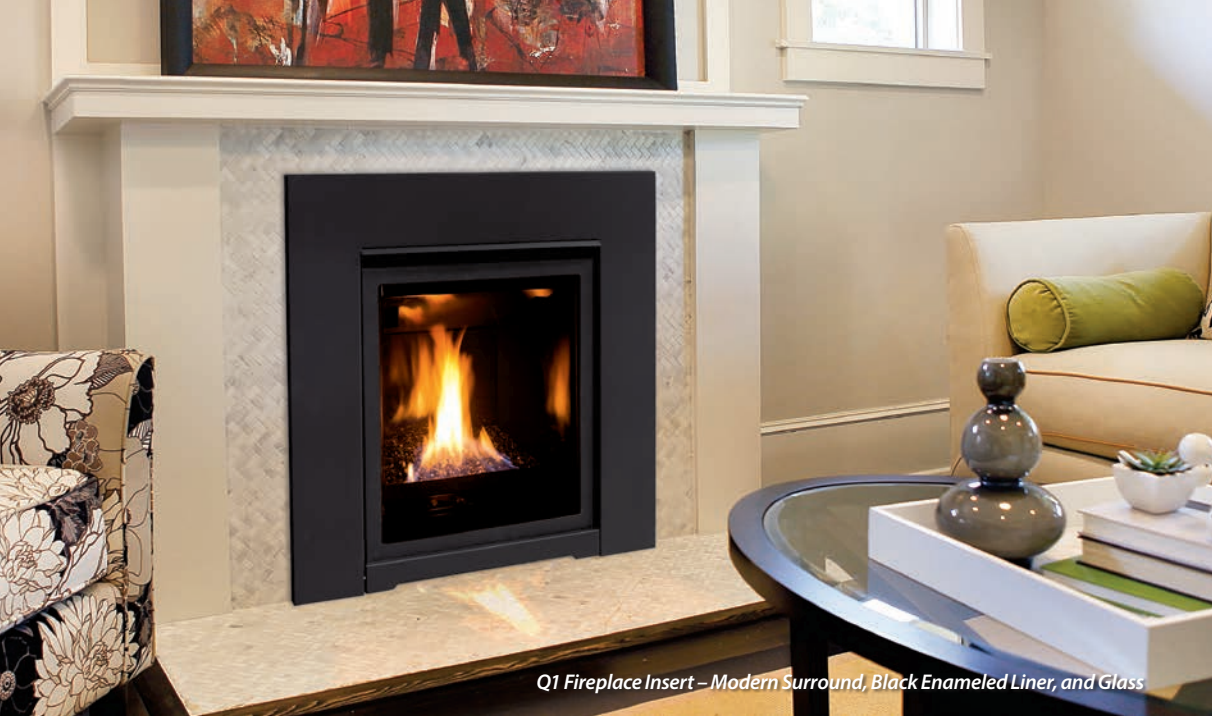
Q1 Fireplace Insert – Modern Surround, Black Enameled Liner, and Glass