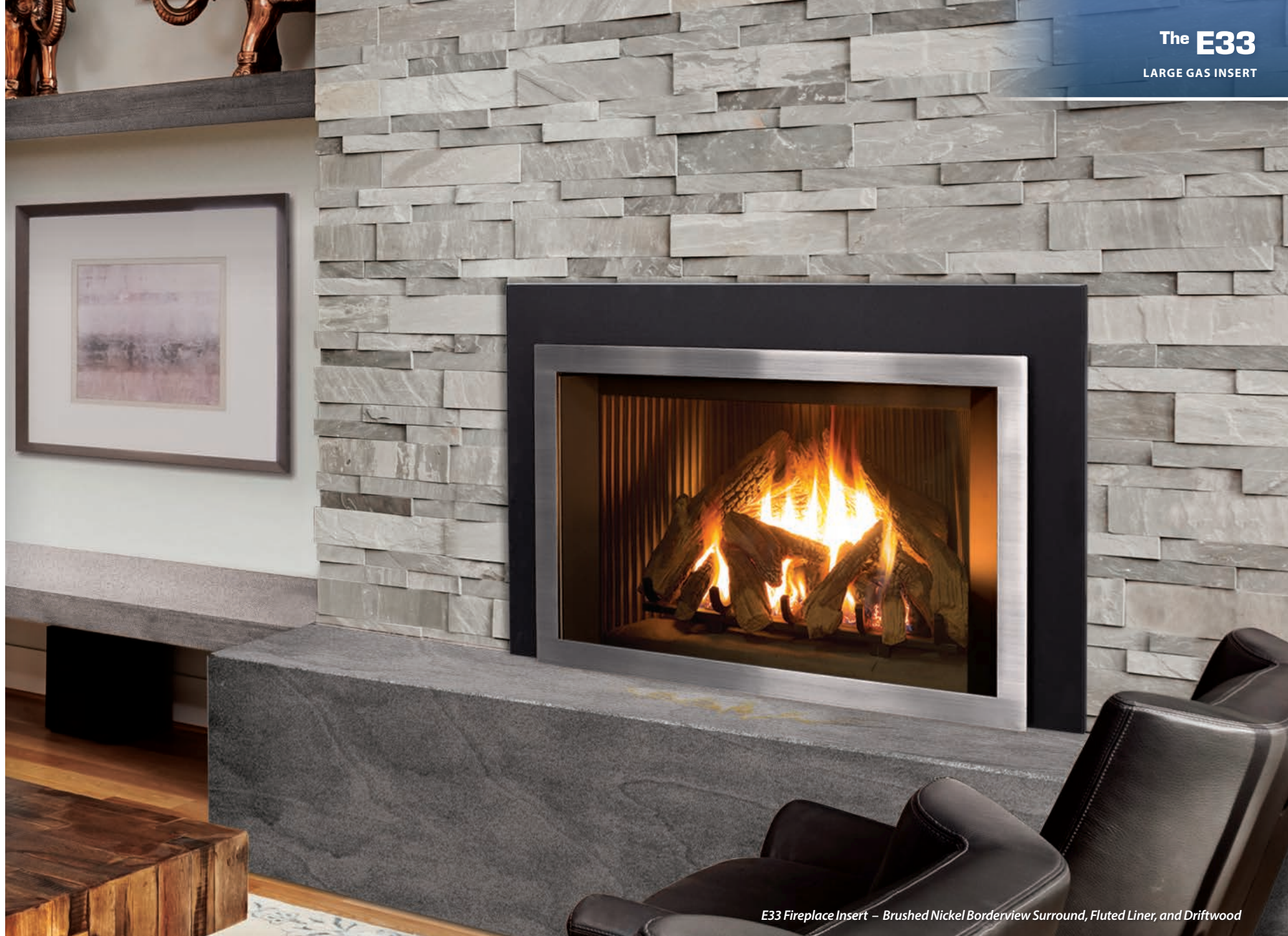
E33 Fireplace Insert – Brushed Nickel Borderview Surround, Fluted Liner, and Driftwood