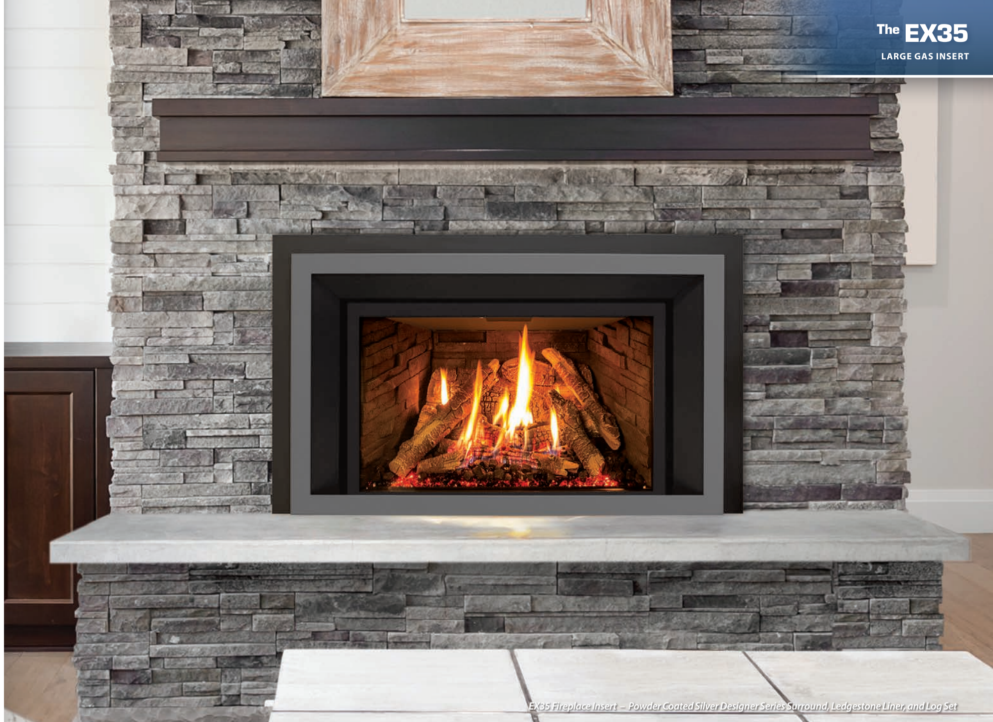
EX35 Fireplace Insert – Powder Coated Silver Designer Series Surround, Ledgestone Liner, and Log Set