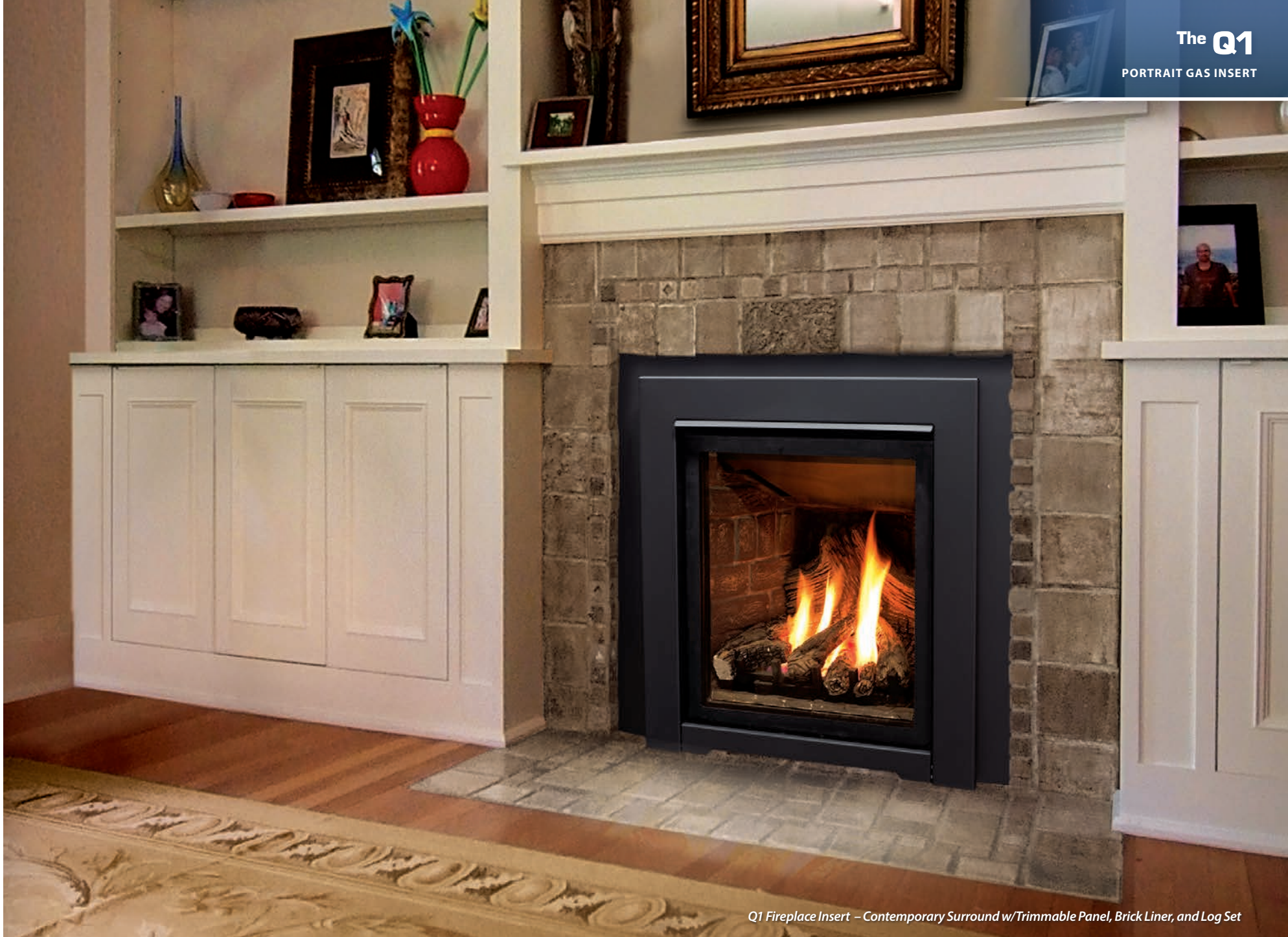
Q1 Fireplace Insert – Contemporary Surround w/Trimmable Panel, Brick Liner, and Log Set