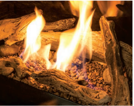
Black Enameled Liner with Driftwood