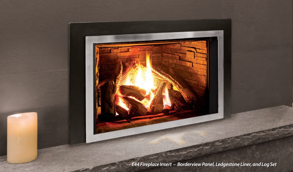
E44 Fireplace Insert – Borderview Panel, LedgeStone Liner, and Log Set