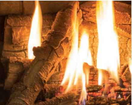
Ultra HD Log Set with Brick Liner

* Turn down is based on a 33% valve and P4 efficiencies output.