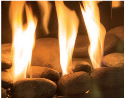
Ceramic Rock Set