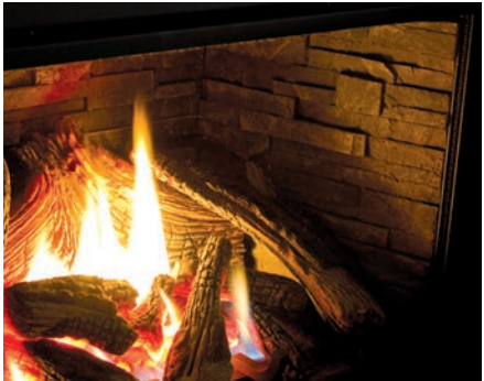
Log Set with LedgeStone Liner