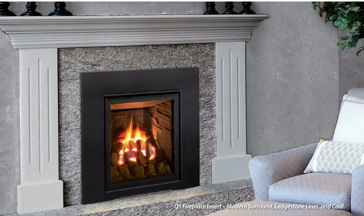
Q1 Fireplace Insert – Modern Surround, Ledgerstone Liner, and Coal