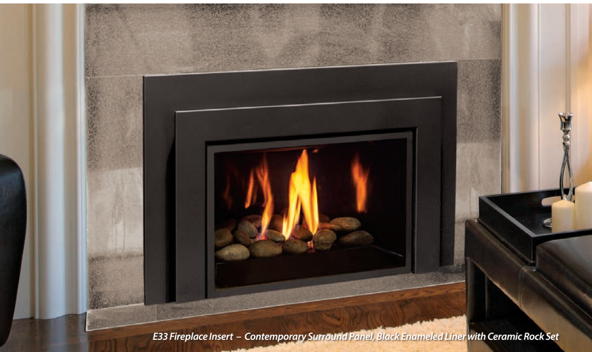
E33 Fireplace Insert – Contemporary Surround Panel, Black Enameled Liner with Ceramic Rock Set