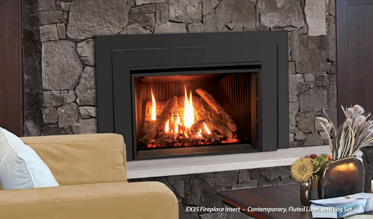
EX35 Fireplace Insert – Contemporary, Fluted Liner, and Log Set