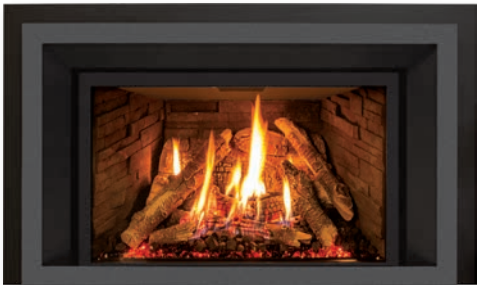
DESIGNER SERIES SURROUND

Available for the E20, E30, E33, EX32, EX35, & E44