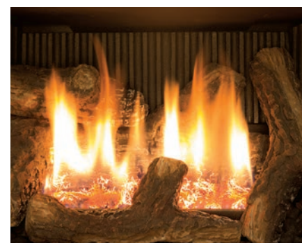
Fluted Liner with Log Set

* Turn down is based on a 50% valve and AFUE efficiencies output.