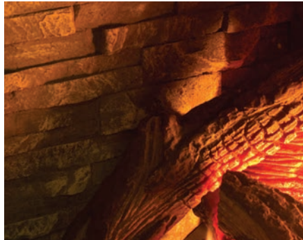
Log Set with Ledgerstone Liner