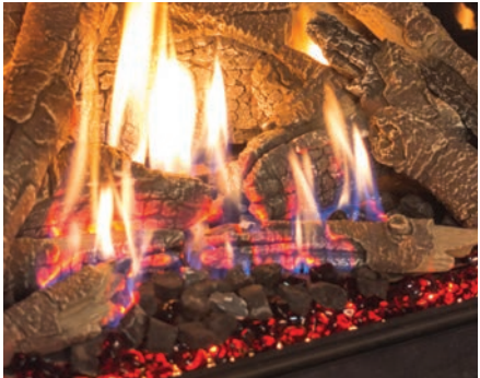
Adjustable Ember Bed Lighting