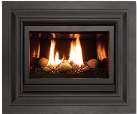
4 - SIDED EXTRUDED