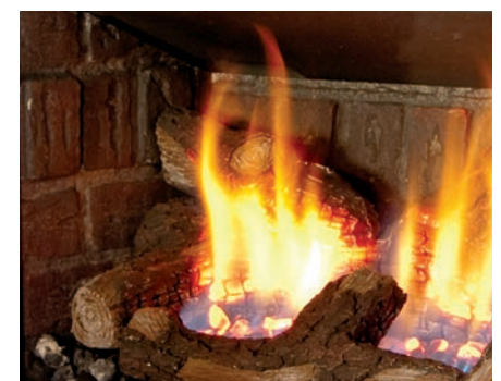
Brick Liner with Log Set