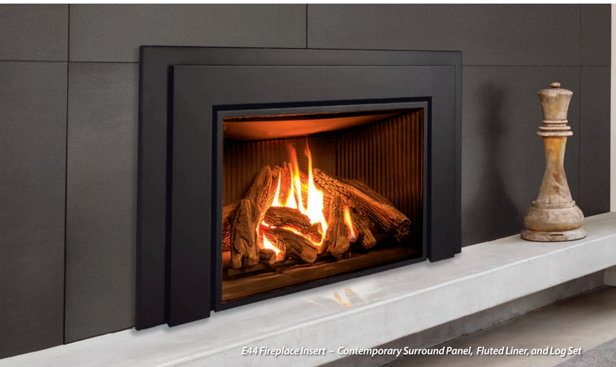
E44 Fireplace Insert – Contemporary Surround Panel, Fluted Liner, and Log Set