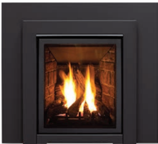
CONTEMPORARY W/TRIMMABLE PANEL