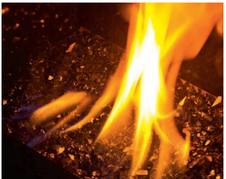
Glass Burner with Crushed Glass