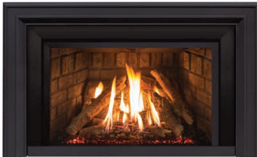
CAST PLUS SURROUND

Available for the E20 & E30 Powder Coated Grey