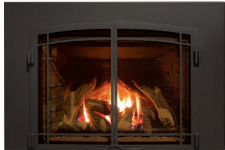
CAPE COD DOORS

Available for the E20, E30, E33, EX32 & EX35 Powder Coated Grey