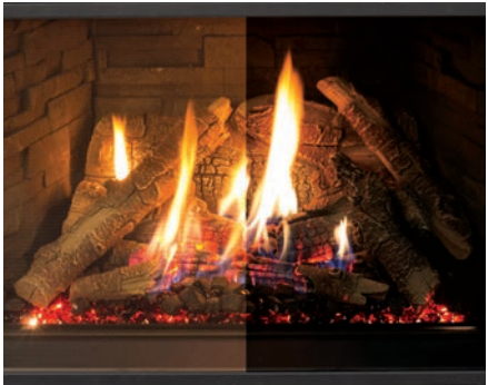
Firebox Top Lighting (Left=On, Right=Off)

* Turn down is based on a 33% valve and P4 efficiencies output.