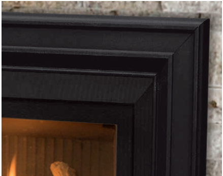
Cast Plus Surround