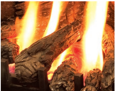
High Definition Log Set

* Turn down is based on a 50% valve and AFUE efficiencies output.