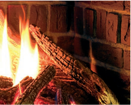
Brick Liner with Log Set

* Turn down is based on a 50% valve and AFUE efficiencies output.