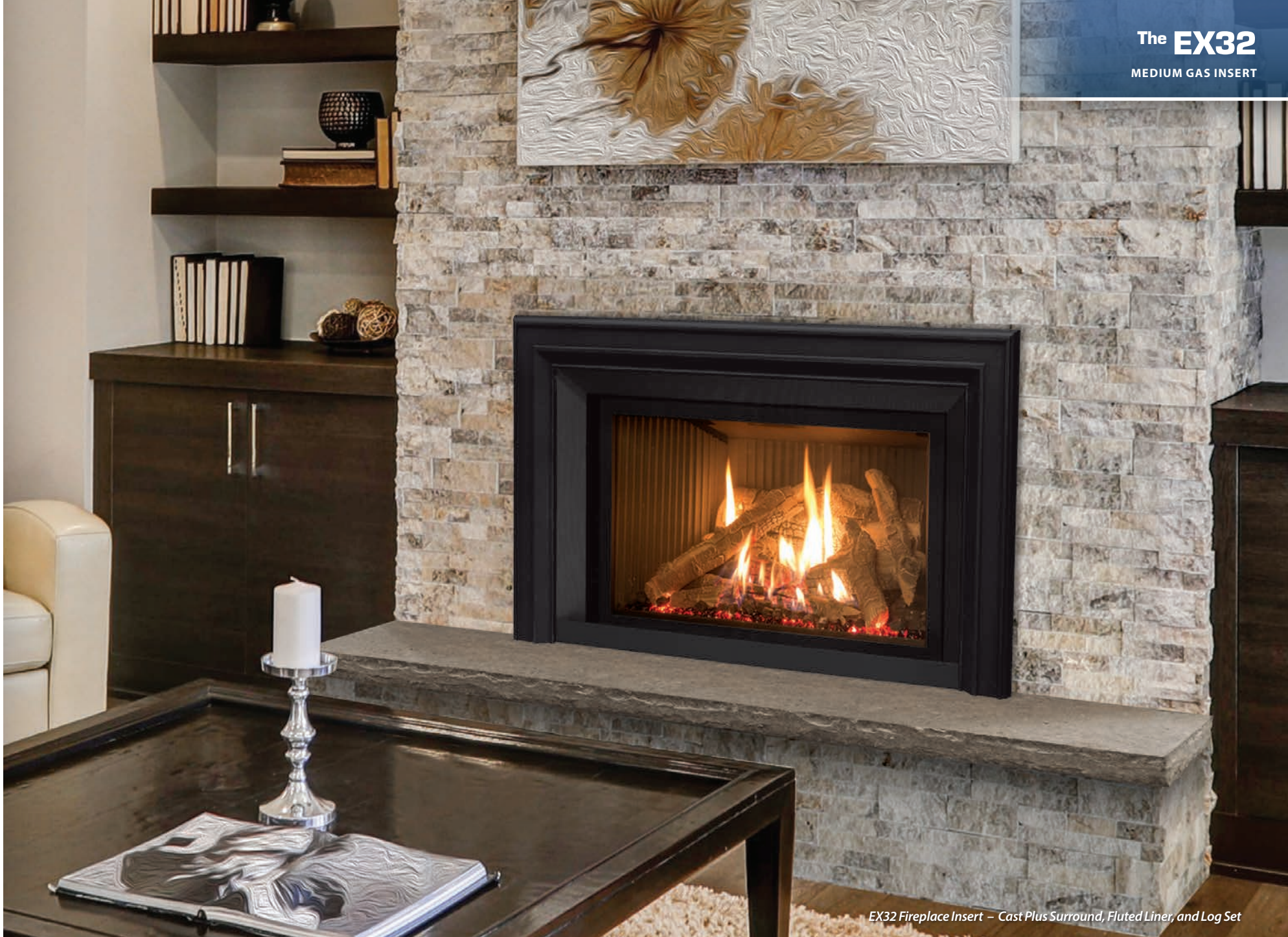
EX32 Fireplace Insert – Cast Plus Surround, Fluted Liner, and Log Set