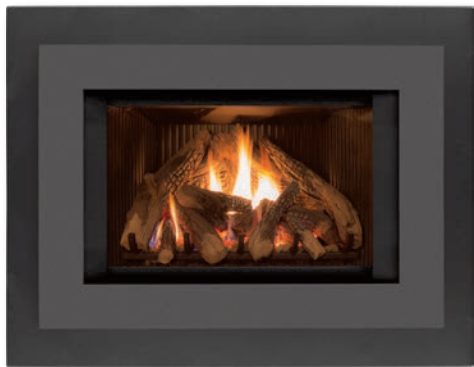
BORDERVIEW PLUS 4S

Available for the E20 & E30 Powder Coated Grey