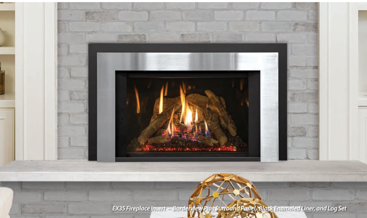
EX35 Fireplace Insert – Border View Plus Surround Panel, Black Enameled Liner, and Log Set