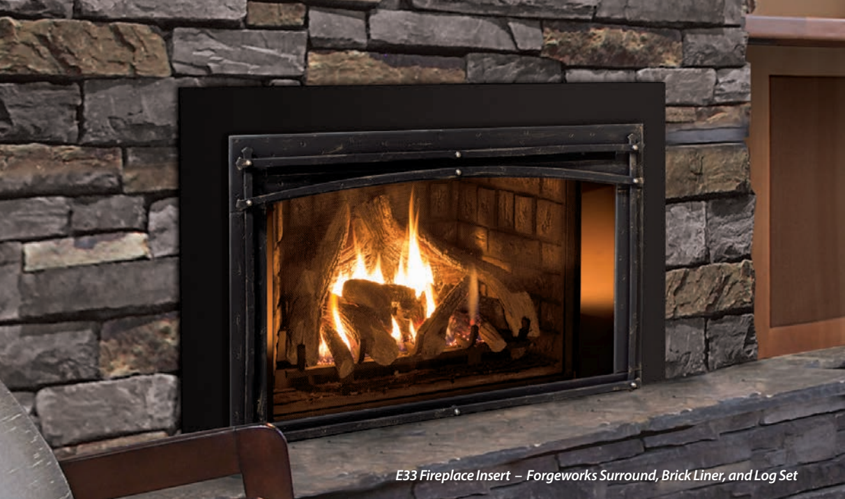
E33 Fireplace Insert – Forgeworks Surround, Brick Liner, and Log Set