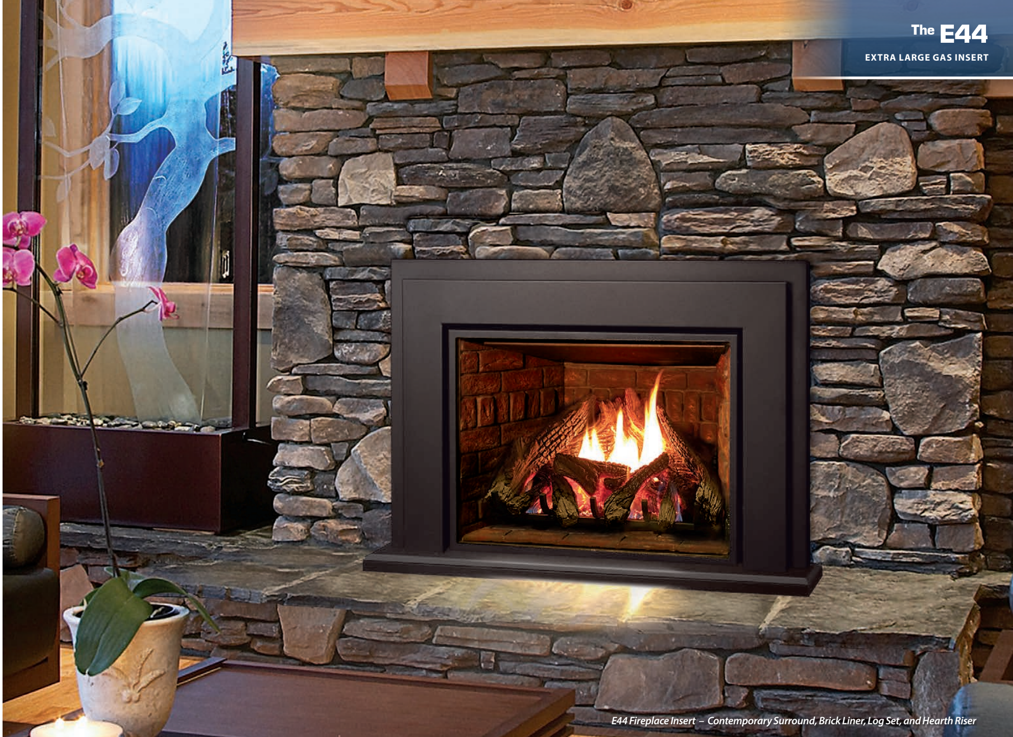
E44 Fireplace Insert – Contemporary Surround, Brick Liner, Log Set, and Hearth Riser