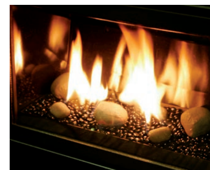
Black Glass with Decorative Stones