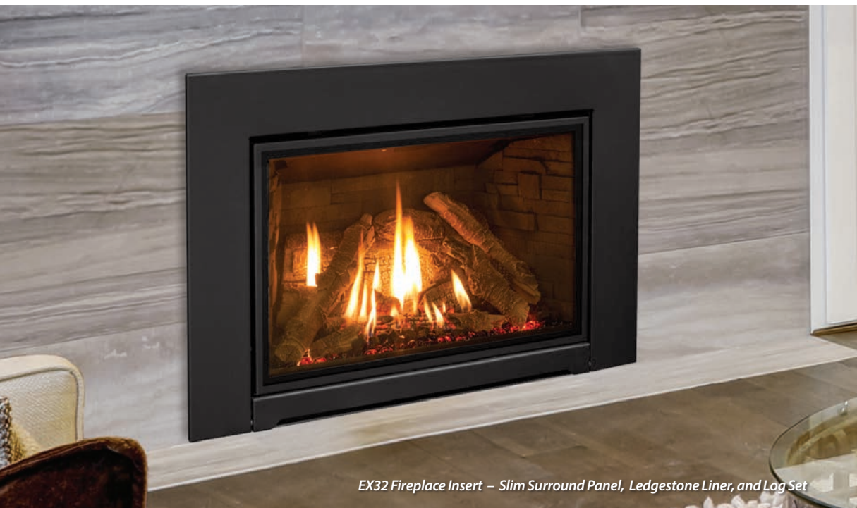
EX32 Fireplace Insert – Slim Surround Panel, LedgeStone Liner, and Log Set