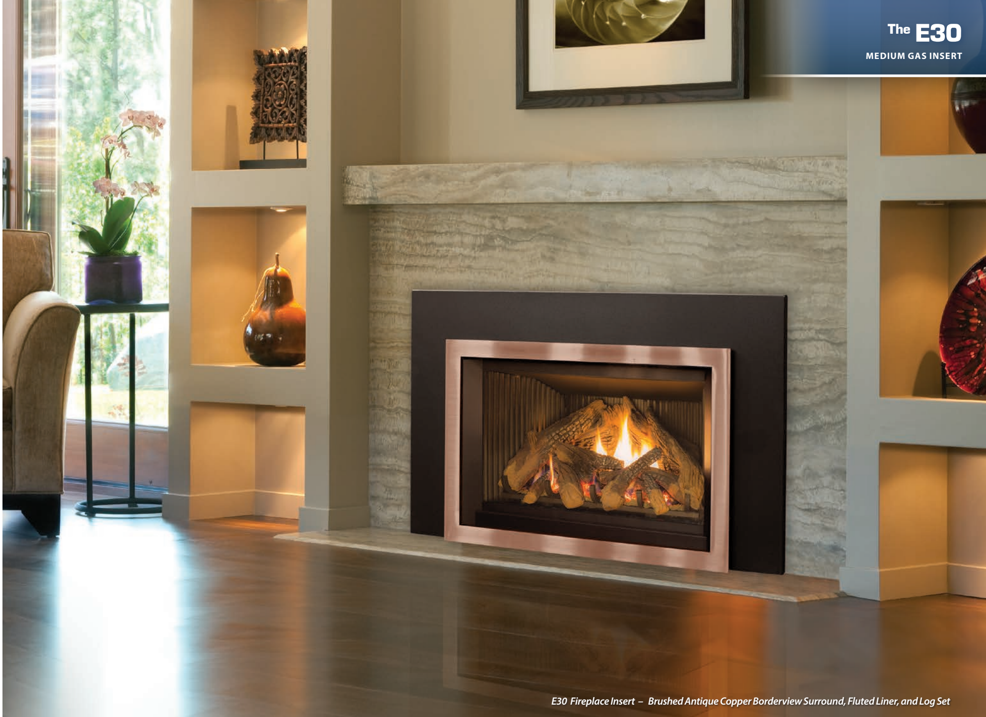
E30 Fireplace Insert – Brushed Antique Copper Borderview Surround, Fluted Liner, and Log Set