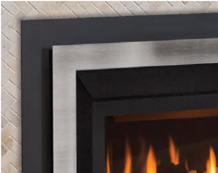
Designer Series Surround