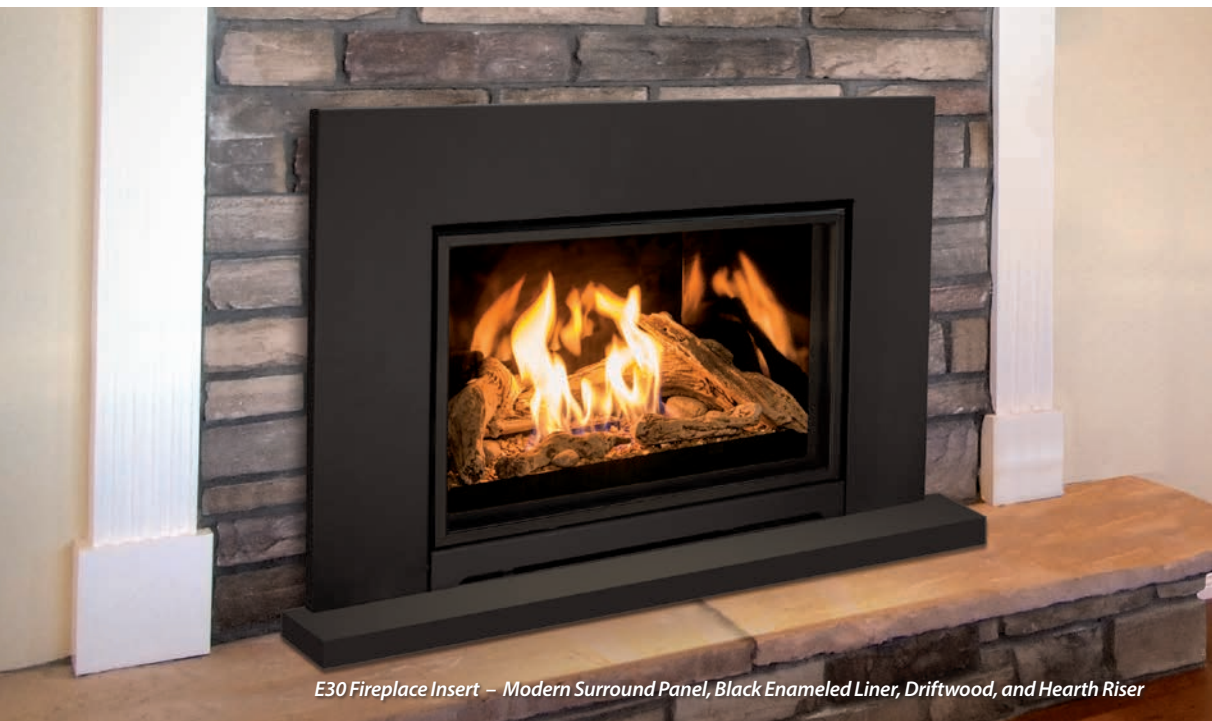
E30 Fireplace Insert – Modern Surround Panel, Black Enameled Liner, Driftwood, and Hearth Riser