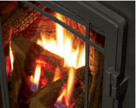
Cape Cod Doors

* Turn down is based on a 33% valve and AFUE efficiencies output.