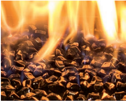
Glass Burner with Diamond Glass