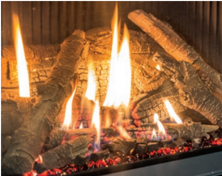
Ultra HD Log Set with Fluted Liner