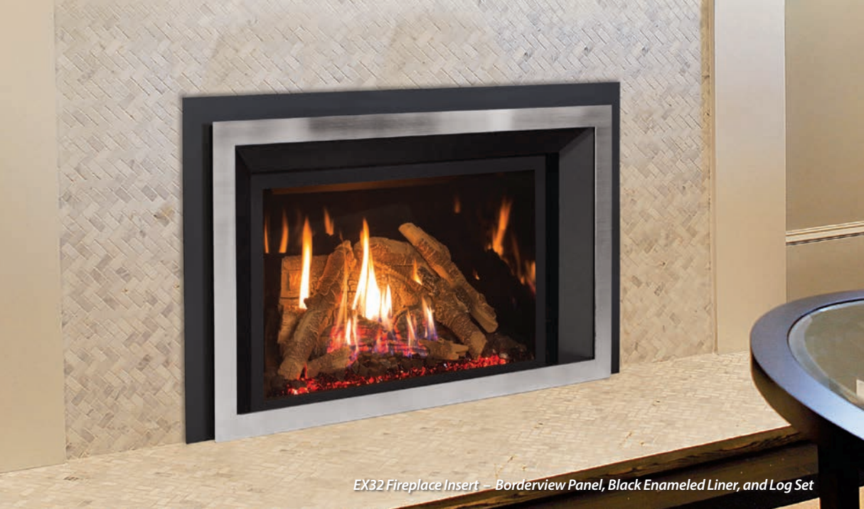
EX32 Fireplace Insert – Borderview Panel, Black Enameled Liner, and Log Set